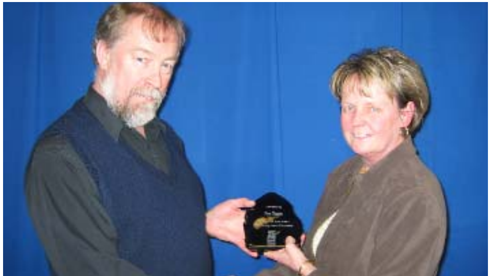
Leadership Award winners