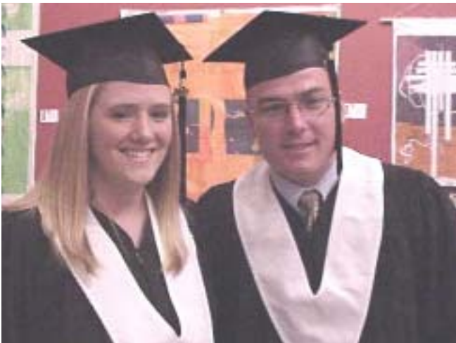
June is graduation time and we, here at the college, would like to extend our best wishes to all those leaving us in pursuit of their new careers!