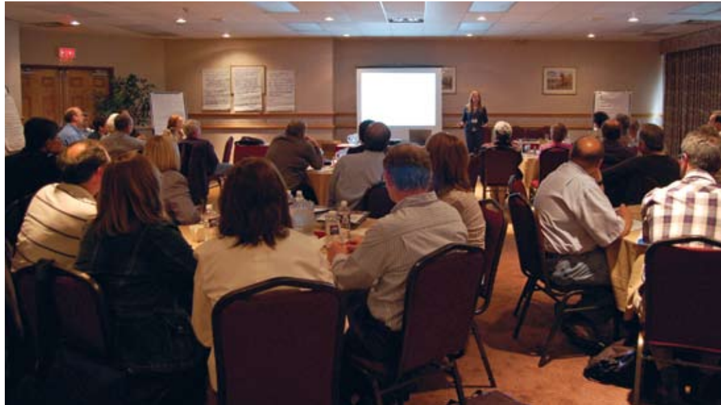
A number of officials from College of the North Atlantic gathered in Stephenville for the second annual program development forum. The event addressed the issues around how the college manages information.

"We felt there was a real need to identify and discuss challenges around how we share information related to program development and review. It's not just to identify challenges but to meet with stakeholders to improve on what is working and arrive at solutions that